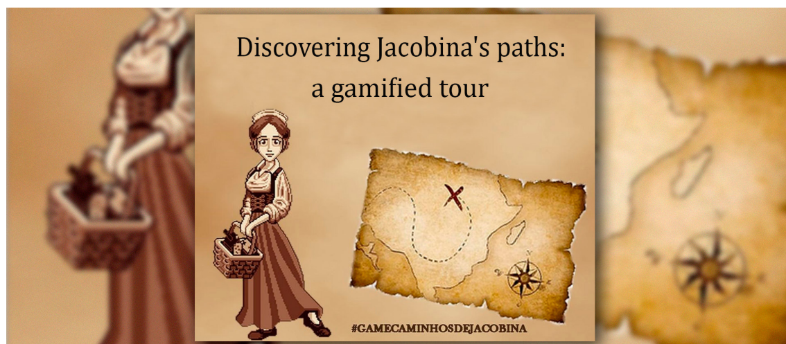
Figure 1 - PAG visual identity Discovering Jacobina's paths: a gamified tour

Next, one of the PAGs entitled Discovering the paths of Jacobina stands out: a gamified tour, which can be accessed via the website produced by students of academic activity. 11