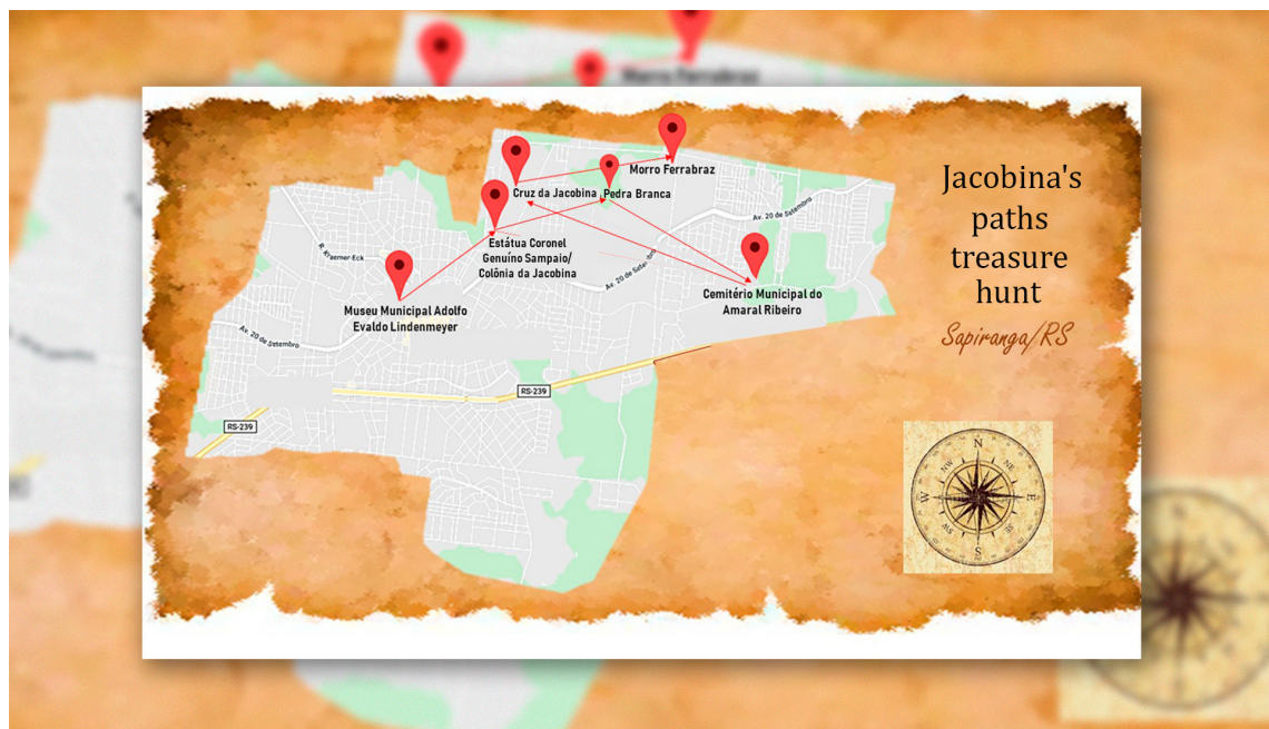
Figure 2 - PAG map Discovering Jacobina's paths: a gamified tour