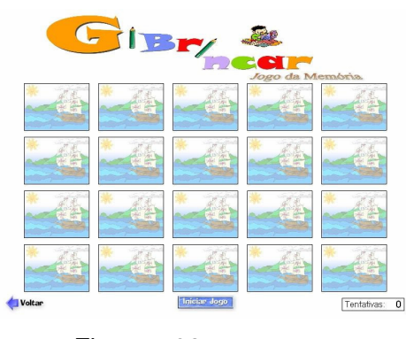
<u> Figure - 08</u>

All this process is guided by software, therefore, it comics to receive its adequate physical form, is necessary the front and verse impression that is guided as each page is printed. In this screen the pupil still has the option to come back to the greeting screen where will be able to entertain itself with the games or to come back to the menu of