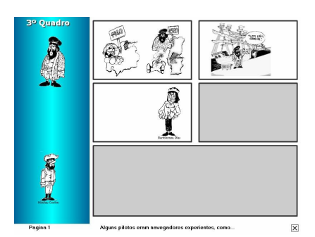
Figure - 04

About the navigation, the pupil will have the possibility to advance for the assembly screen or to retrocede to the menu being able to select another personage. Of this form it was created possibility of choice of clear form and objective so that the user can construct its knowledge. The assembly of the comics is proposal of interactive form. In the assembly screen (Figure - 04) pertinent images to the picture are